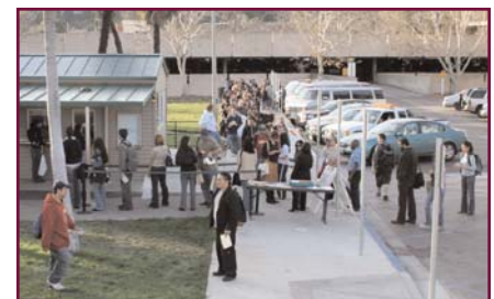
No more long lines like this!